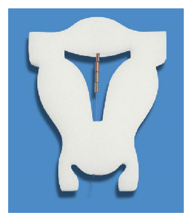
Figure I The small GyneFix® 200 IUD (Contrel Research, Ghent, Belgium) is shown inserted in a foam uterus.

A review of clinical results with the frameless copper IUDs was reported previously.<sup>11</sup> The current report focuses on