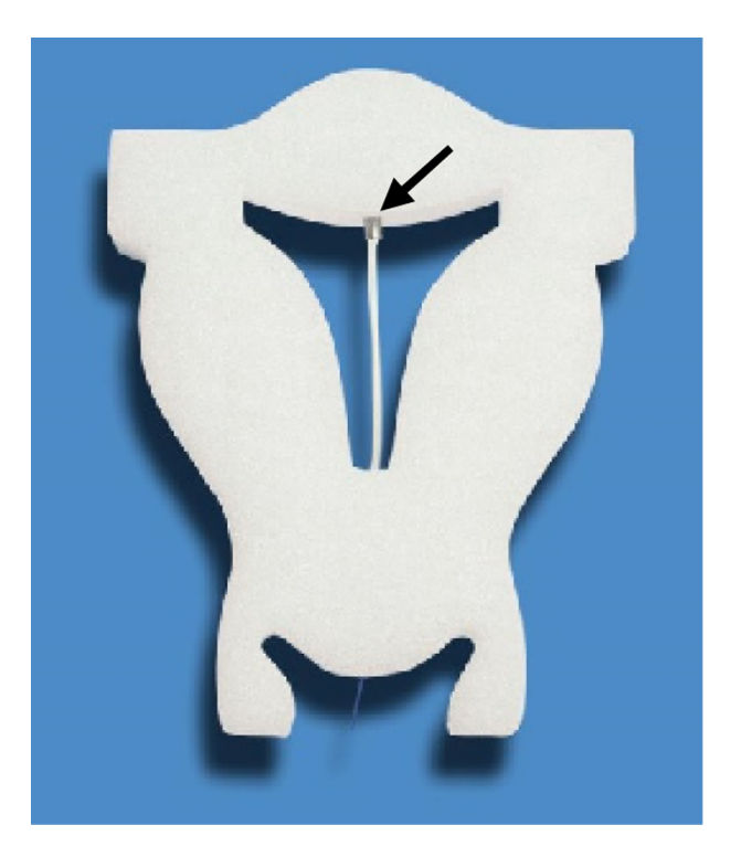
Figure 2 The FibroPlant<sup>®</sup> LNG-IUS is shown inserted in a foam uterus with stainless steel clip at the upper end (arrow).

Note: FibroPlant LNG-IUS, Contrel Research (Ghent, Belgium). Abbreviations: IUS, LNG-releasing intrauterine system; LNG, levonorgestrel.